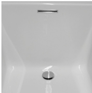
Linear Integral Waste and Overflow