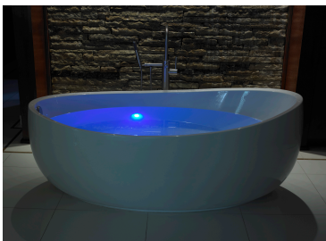
Chromatherapy-LED Lighting System