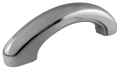
Standard Grab Bar