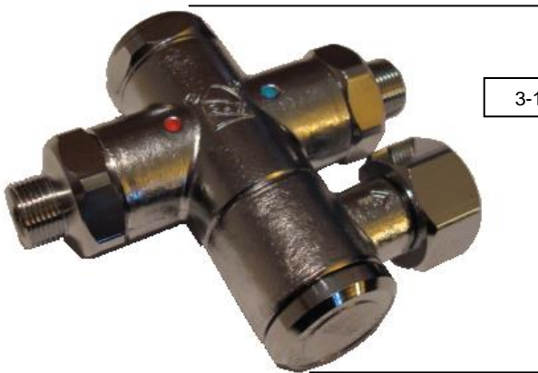
Mixing valve 3/8" compression inlets 1/2" NPT outlet